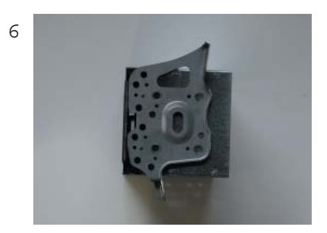
Place the OEM radio brackets on the meta bracket of the new headunit. This will fit in the holes of the metal bracket(if needed m ount it w ith screws).