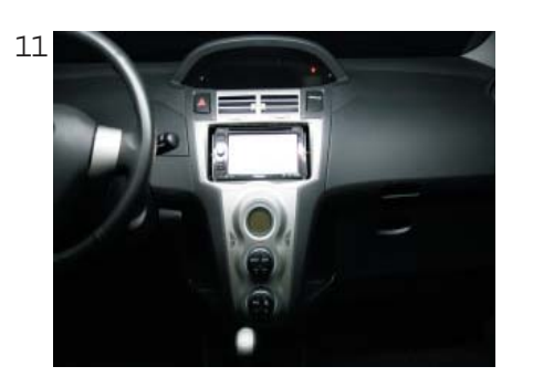
Place the new headunit and the side panels