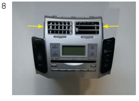
Rem ove the air shafts from the original radio and replace them in the OEM replacem ent panel.