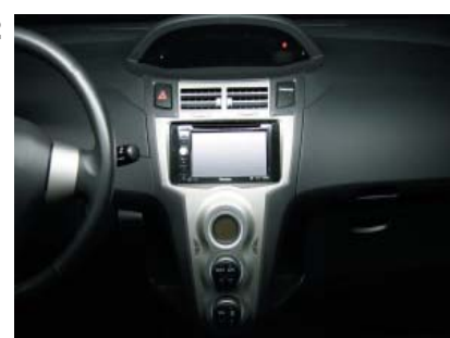
Place the radio trim .