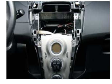
Place the m etal bracket into the dashboard between the m etalOEM brackets.