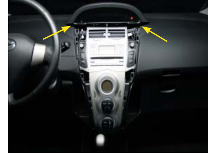
Lift up the panelabove the air shafts at the location of the arrows by using a plastic wedge.