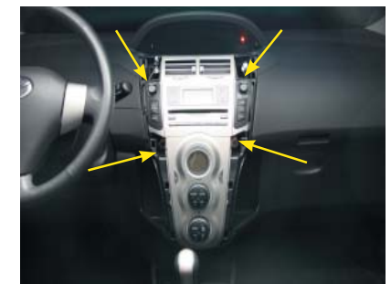
Rem ove the OEM radio at the location of the arrows. The radio is tighten by four screws.