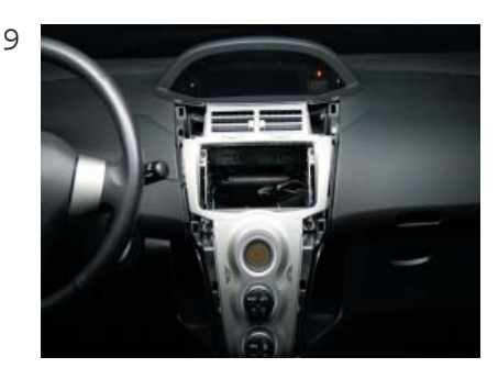
Place the OEM replacem entpanel.