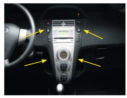
Rem ove the dashboardpanels around the radio at the location of the armows.